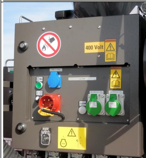
Filename: e+_screed_heat_01.JPG e+ Screed Heat