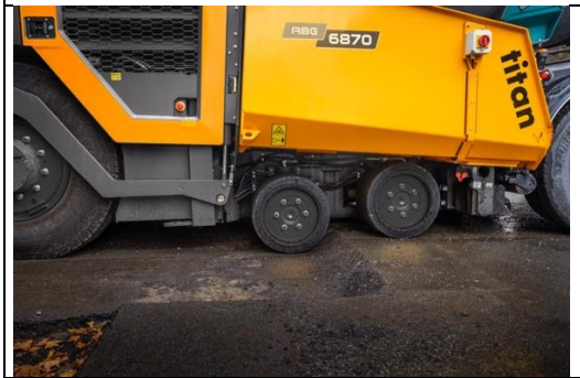
Filename: ABG_6870-StageV-2_38625.jpg Ride leveller for wheeled pavers