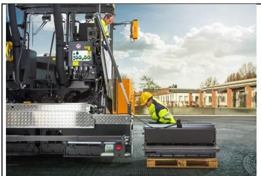
Filename: ABG_6820_7820-T4f_T3-2_12220.jpg Unique quick-coupling