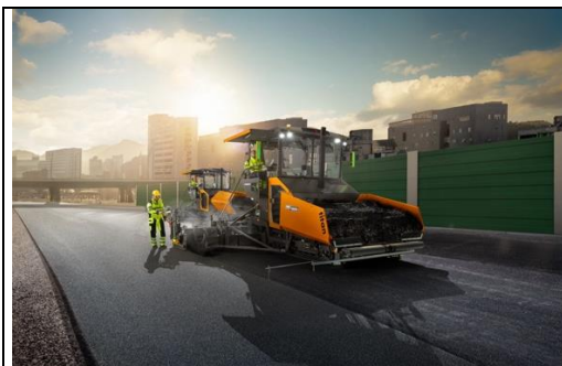
Filename: ABG_6820-T3_T4f.jpg The ABG Advantage